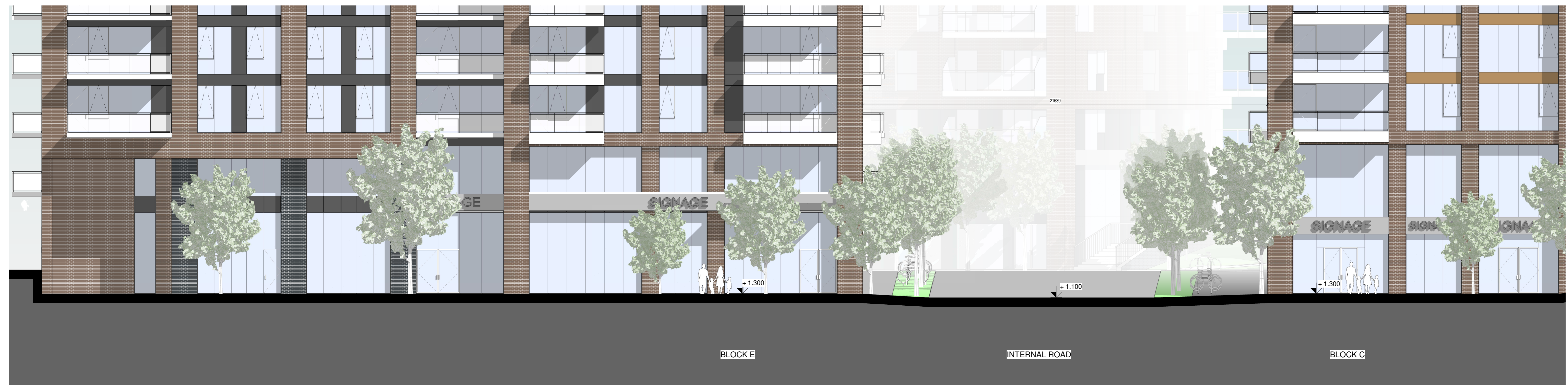
2 CONTEXTUAL SITE SECTION D-D - DETAIL 1:100