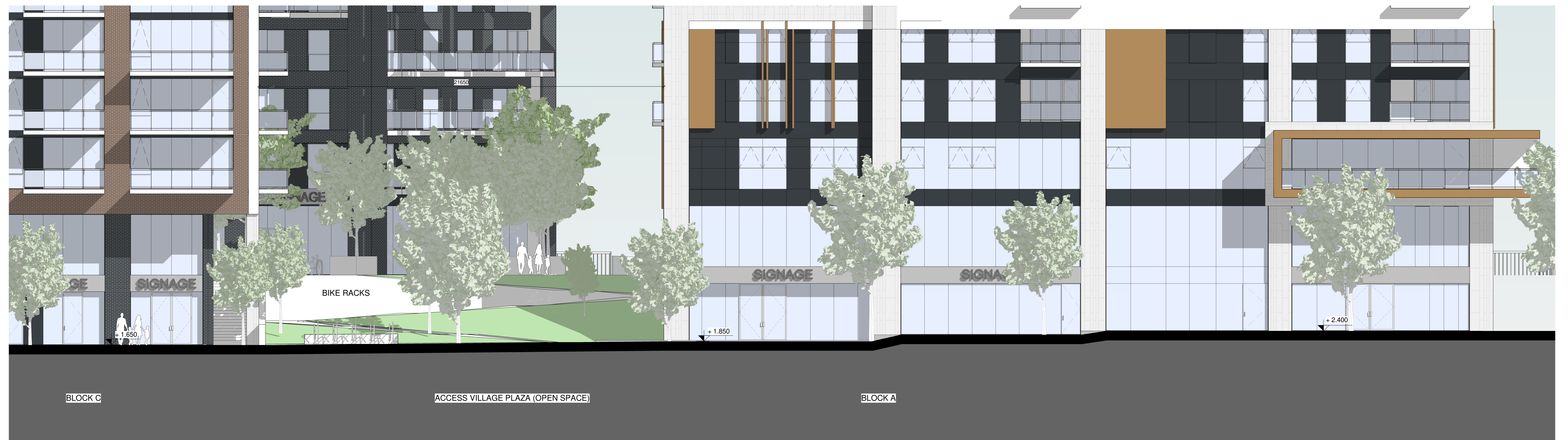
3 CONTEXTUAL SITE SECTION D-D - DETAIL 1:100